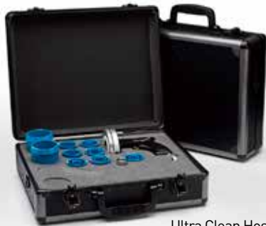
Ultra Clean Hose Cleaning Kit

Along with the pellet flushing system, Parker offers an innovative capping system. Clean Seal is a quick, easy, and clean alternative to cap your hose and fitting assemblies. This reduces contamination, capping time, and cap inventory as one cap may fit many different end configurations and sizes. Simply place the cap on the end of your hose or fitting, place in the Clean Seal System for a few seconds, and remove. The caps enable a secure fit due to the heat shrink technology. Caps can just as easily be removed by pulling the tab that sticks up once heated.