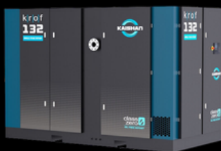
Rotary Screw Oil-Free